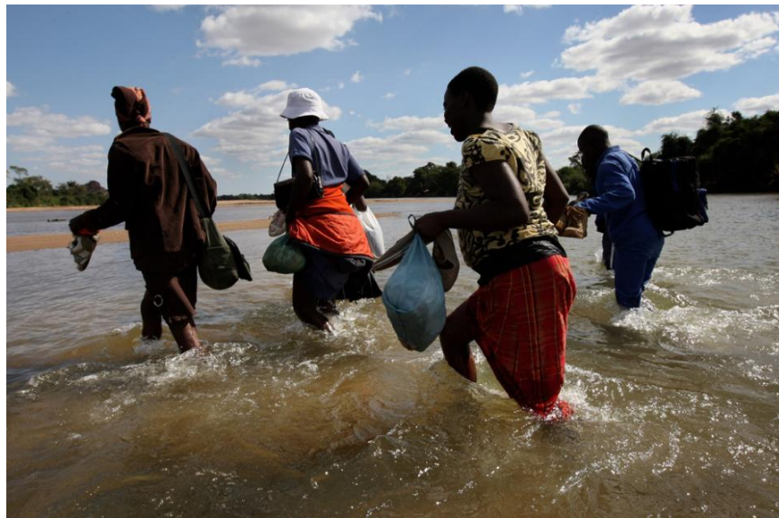
Informal border crossing of Limpopo River which divides Zimbabwe and South Africa